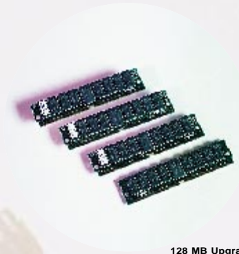
128 MB Upgrade