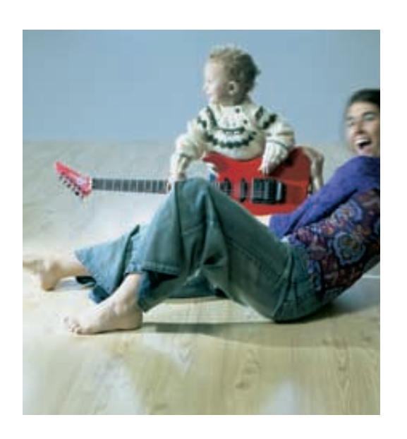
ORIGINAL COLLECTION CLASSIC PLUS COLLECTION