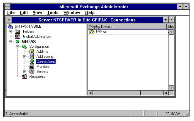
The Exchange administrator

The setup of the FAXmaker users is done from the Exchange Administrator. The person who is authorised to supervise the system can add or delete FAXmaker users and administer their settings.