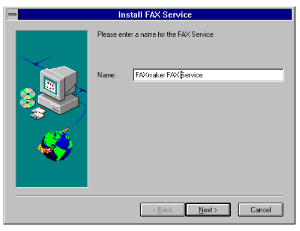
Setup prompts for a fax server service name

After the software has been installed, the setup program will continue to install a program group for FAXmaker. The program group includes a fax server setup program, which is also listed in the control panel. Before starting the fax server service, please setup the fax server using this program. For more information regarding setting up the fax server, please refer to the chapter on fax server setup.