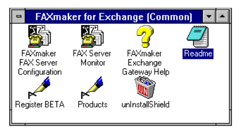
The FAXmaker for Exchange program group

After the software has been installed, the setup program will continue to install a program group for FAXmaker. The program group includes a fax server setup program, which is also listed in the control panel. Before starting the fax server service, please setup the fax server using this program. For more information regarding setting up the fax server, please refer to the chapter on fax server setup.