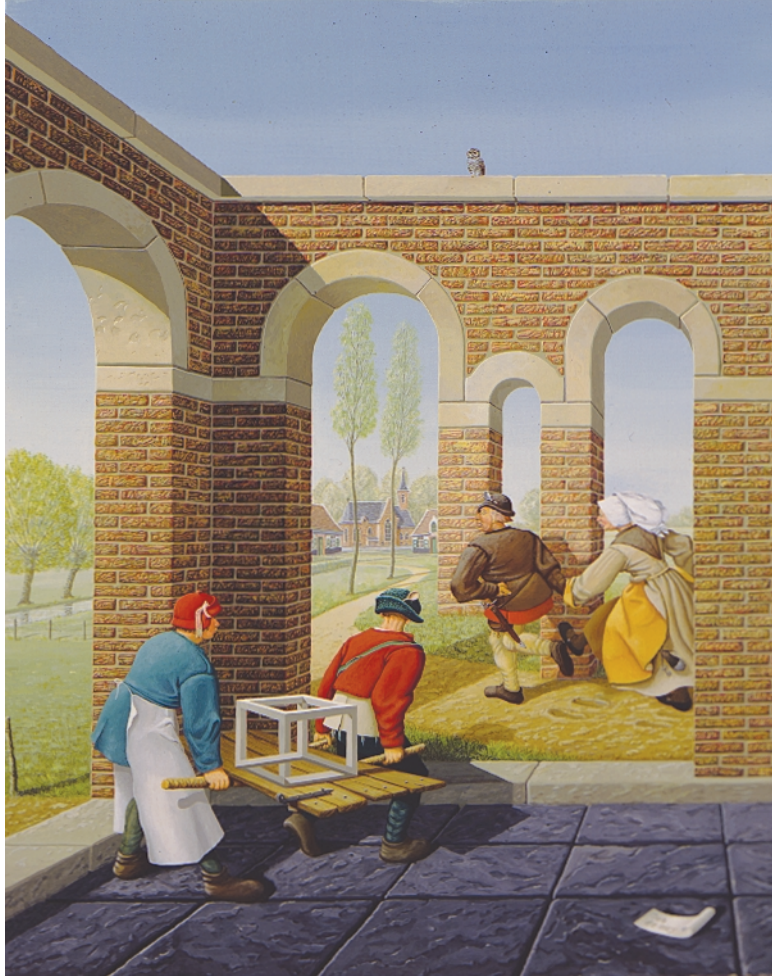
Where Are They Going? 1996