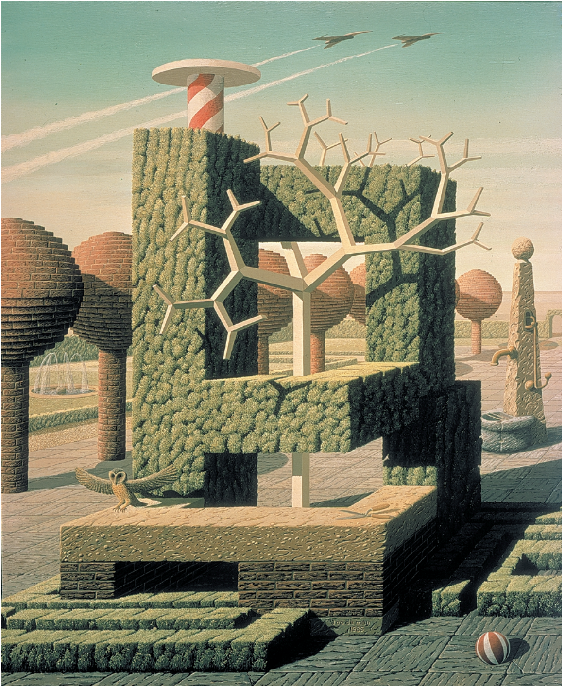
With the Tardy Compliments of Monsieur Le Nôtre. 1983