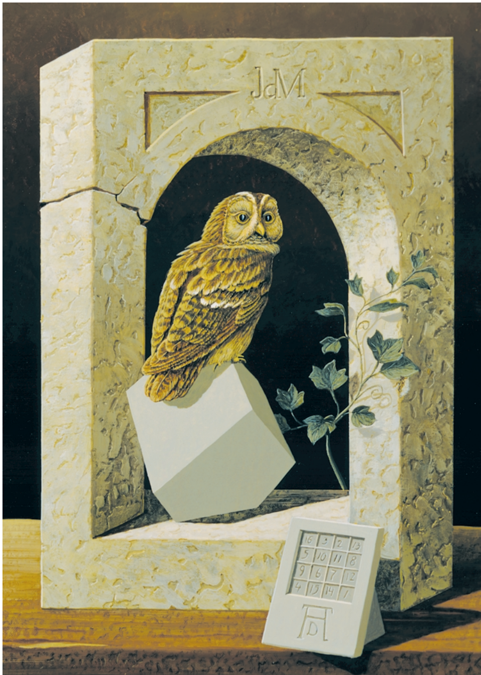
Meeting of Jos de Mey's Owl with the Stone of the Wise Dürer. 1997