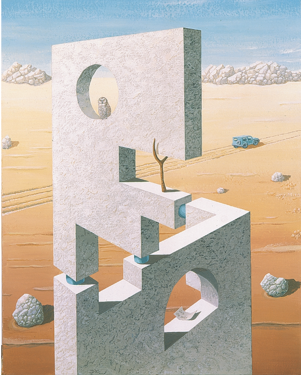
Fantastic Construction in the Great Desert. 1997