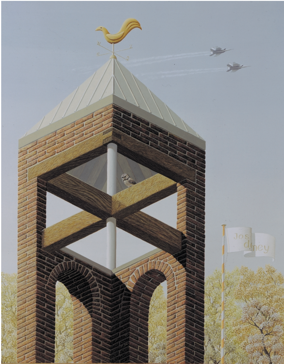
Just As the Rooster on this Tower Crows, he Crows Nowhere... 1987