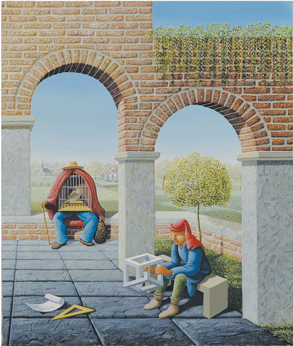
Escher's Thinker Observed by Magritte's Therapist. 1997