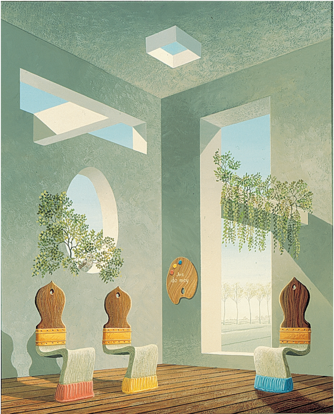
The Painter's Waiting Room. 1996