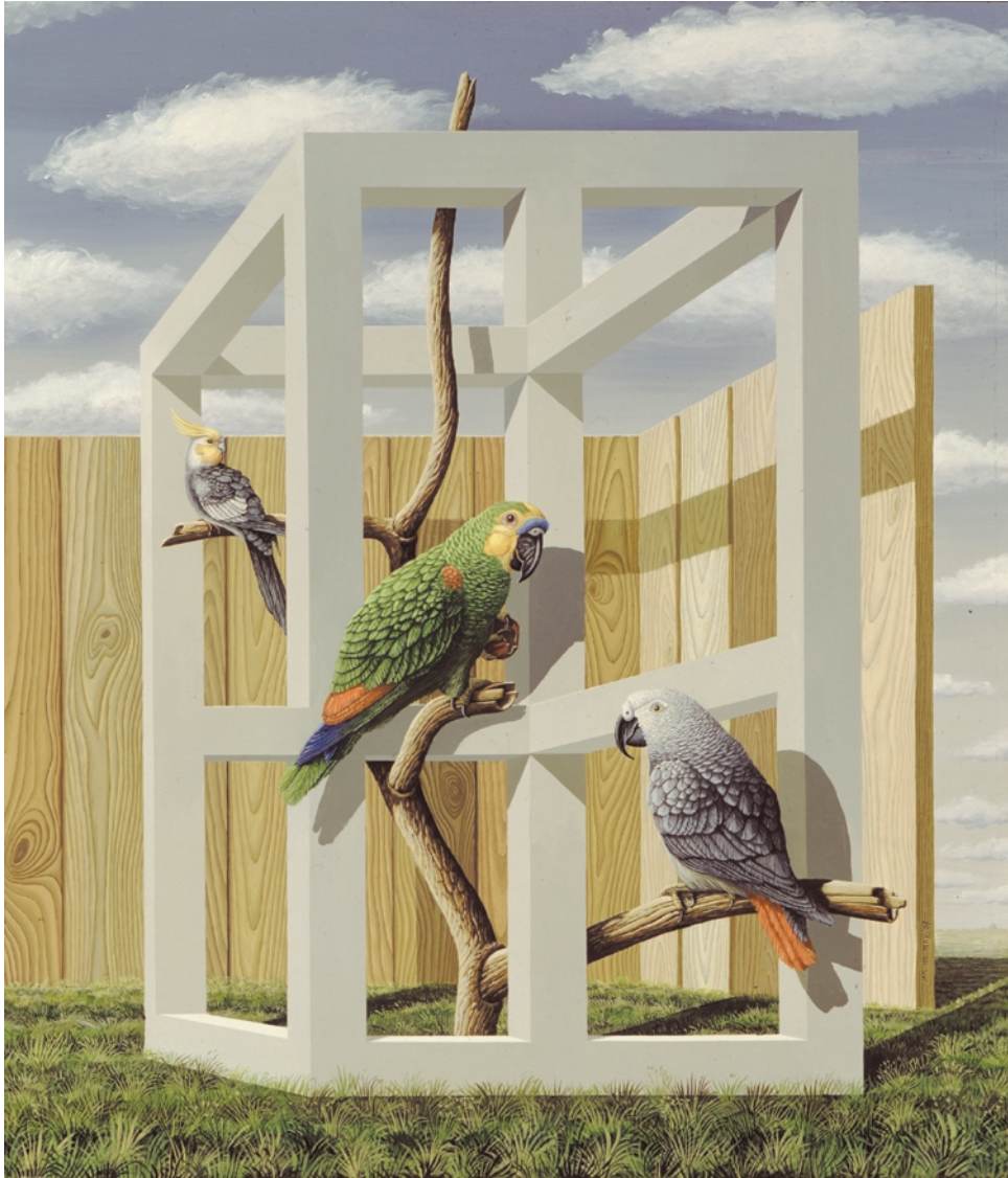
Strange Panopticum-construction for Parrots and Family. 1987