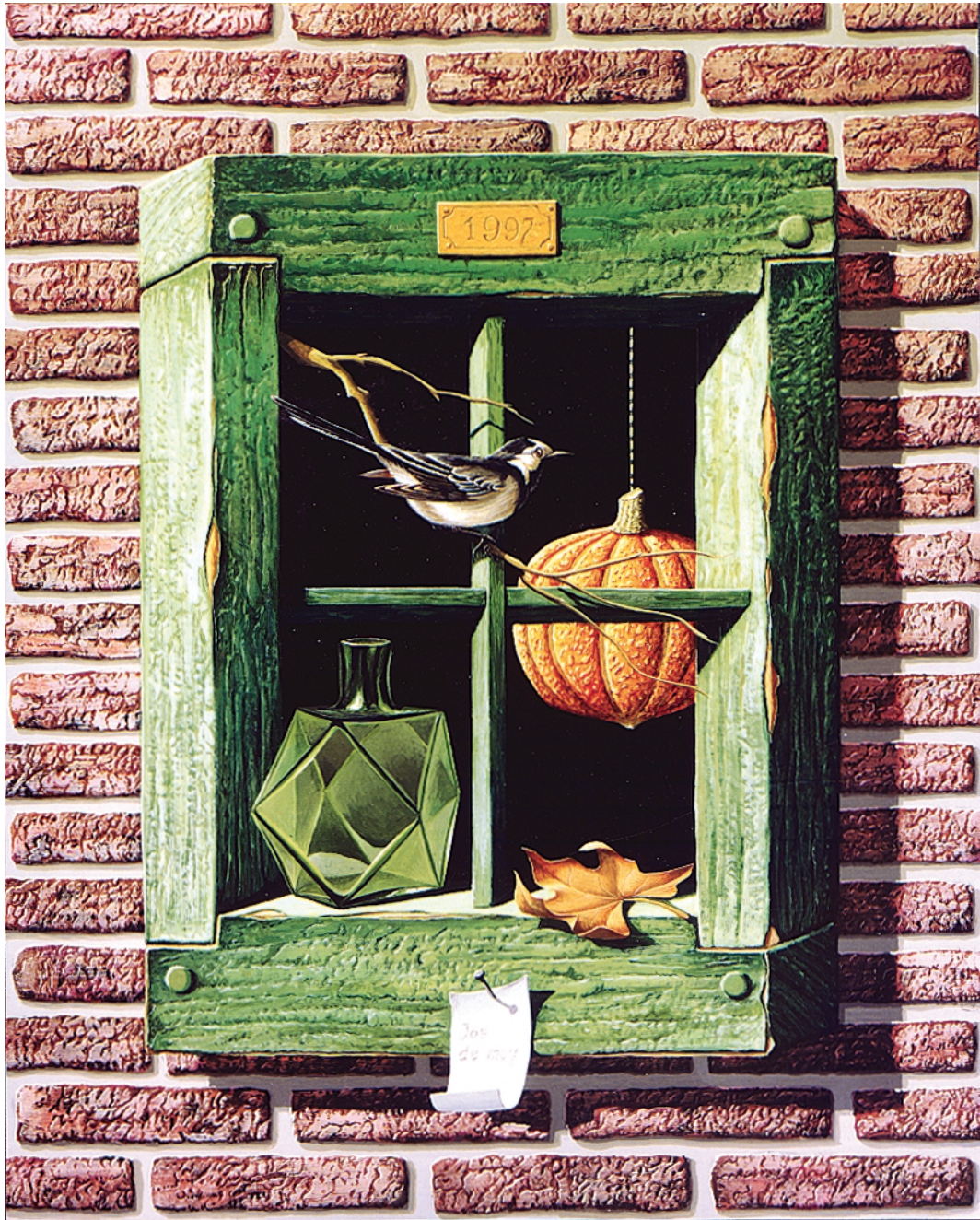
Curious Wagtail in a Strange Small Window. 1977