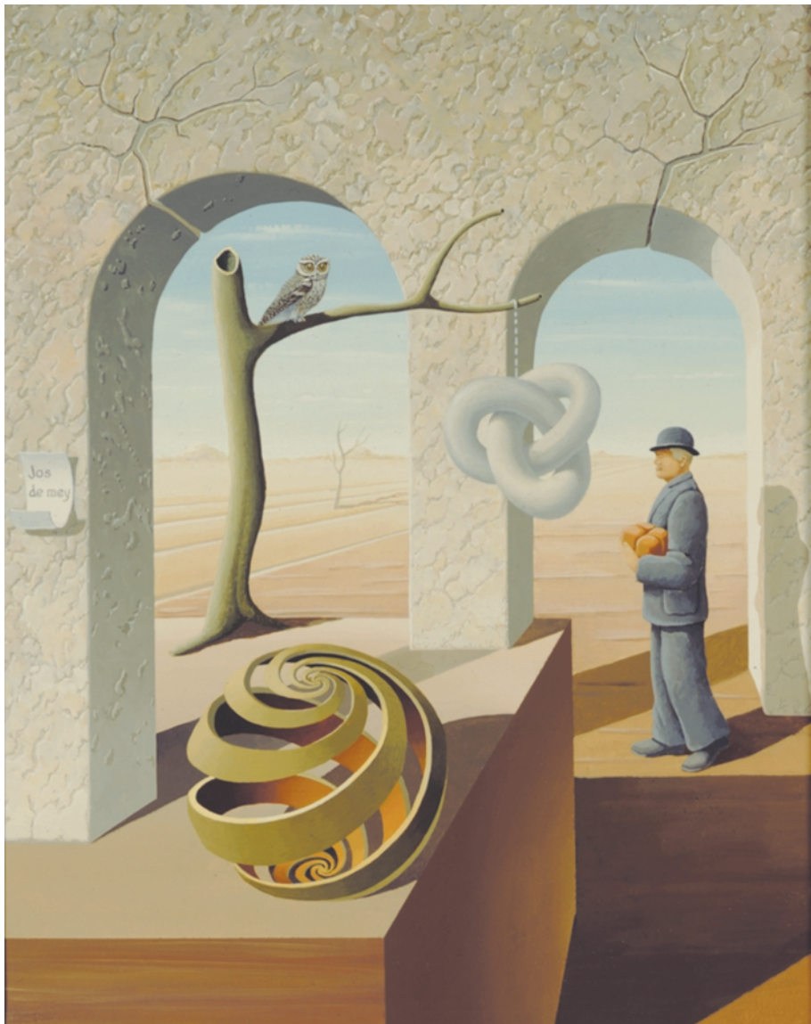
Escher-ball and -knot with Magritte-man in a Constructed Landscape by J.d.M. 1996