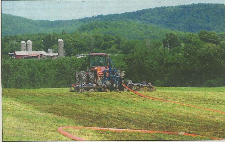
Spreading manure with drag-lines has helped Blue Spruce Farm maintain good relationships with neighbors.