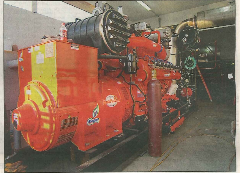
Utilizing "Cow Power" in an anaerobic digester helps Blue Spruce save money.

going up and down roads, traffic which the public tends to dislike.