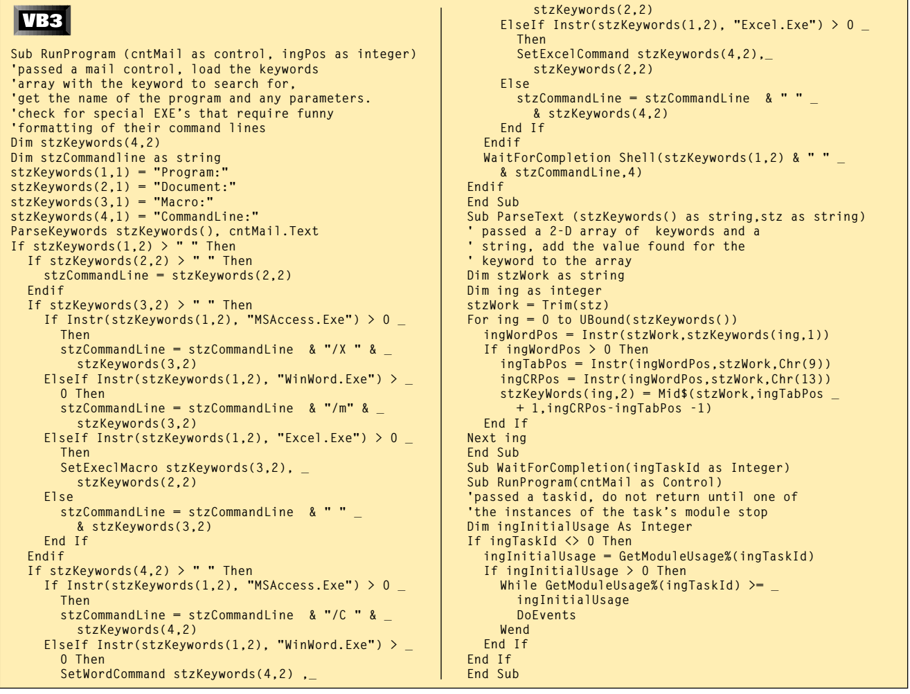
LISTING 2 Looking for Keywords. The ParseText routine provides a standard way for each message-type routine to find its keywords. With VB4's improved variants, you can implement this as a function. RunProgram is the workhorse routine in MailHandler and shows how the ParseText routine is used. WaitForCompletion uses a Windows API call to pause MailHandler until the program completes.