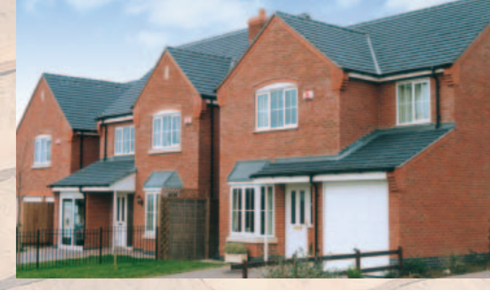
20 x 30 Burnt Red