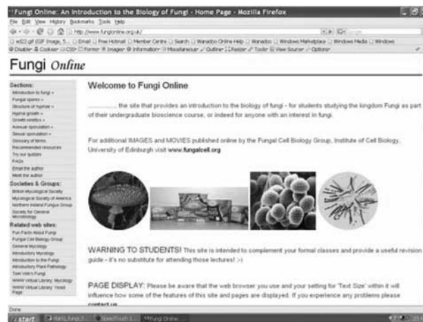
Figure 1: Fungi Online home page at www.fungionline.org.uk