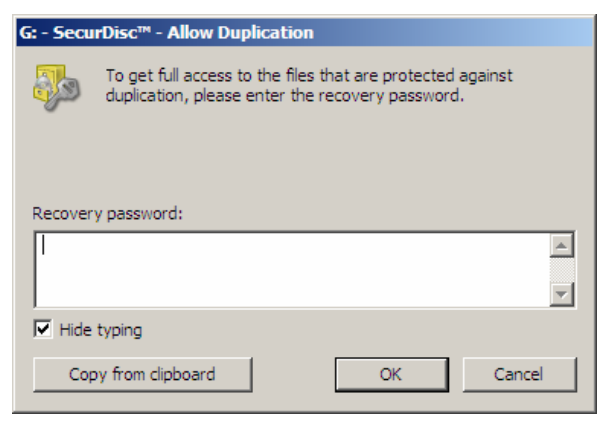
Fig. 5: SecurDisc™ - Allow Duplication window