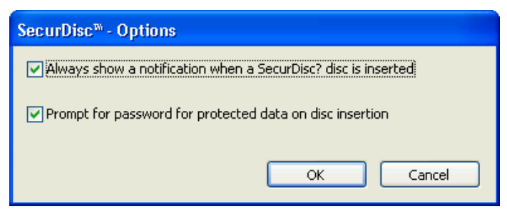
Fig. 1: \mathbf{SecurDisc}^{\mathsf{TM}} - \mathbf{Options} window

In this window you can specify how SecurDisc ^{\text{TM}} should behave when a SecurDisc ^{\text{TM}} disc is inserted.