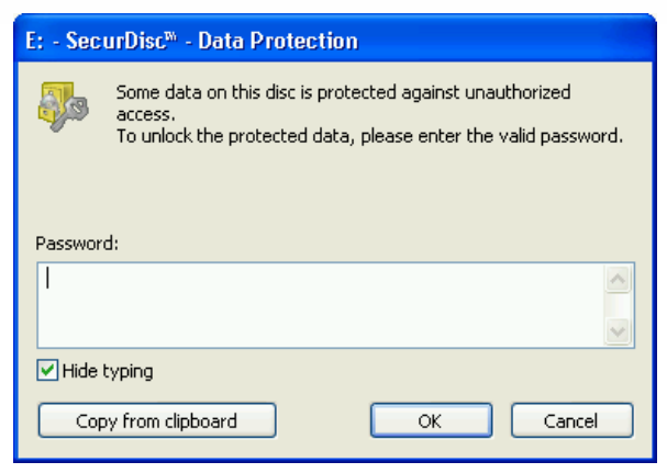
Fig. 3: SecurDisc™ - Data Protection window