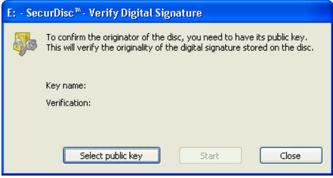
Fig. 4: SecurDisc™ - Verify Digital Signature window