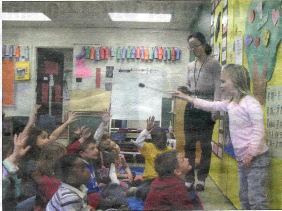
Two years ago UCS introduced an innovative partial immersion Mandarin Chinese program. Thanks to the Project CLIME (Critical Language Initiative in Mandarin Education) federal grant, the district enhanced its K-12 foreign language program by offering parents the opportunity to enroll their child in a full day kindergarten program taught half in Mandarin and the other half in English.

Rather than learning in a teacher-directed lecture format, students are encouraged to become critical thinkers