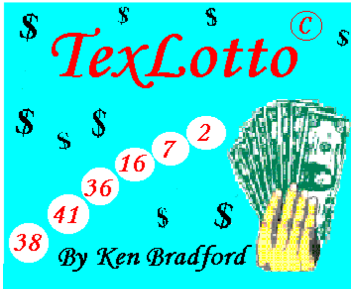
Texlotto Over Due Numbers