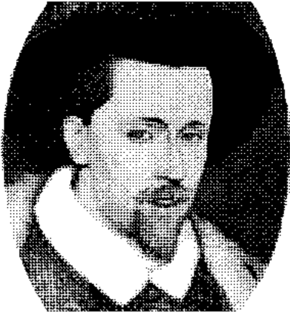
King James I of England (age 27)