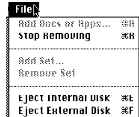
After choosing Remove Set

Remove the names of unwanted files from SuperFinder™ buttons to provide space for more important files. Click on the buttons with the names you do not want anymore. When you have completed removing the names, choose Stop Removing from the File menu which will appear in the same location as the Remove Docs or Apps item had been previously.