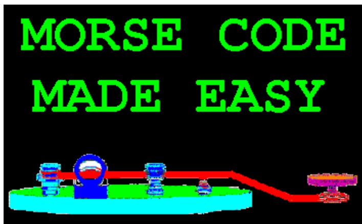
MsCode CODE TABLE