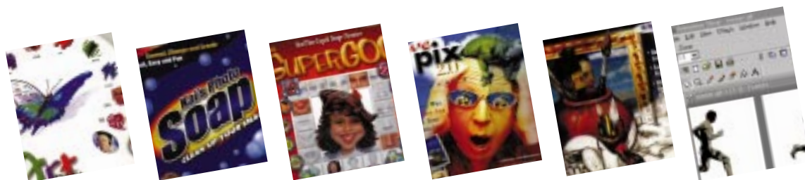
Image-editing software compared