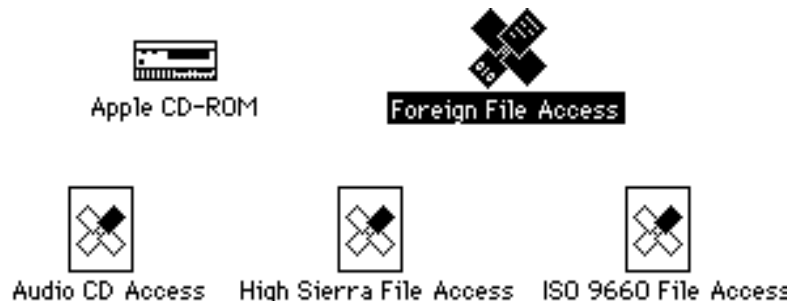
Figure 1—Apple CD-ROM Driver and Foreign File Access Software

'sysz' is too small discs do not mount, but if it is too big it wastes precious memory. Using the default 'sysz' value, Foreign File Access cannot handle a CD-ROM with an extremely large number of files and directories. In addition, with multiple AppleCD SC drives connected, Foreign File Access may run out of memory if multiple ISO or High Sierra CD-ROM discs are mounted.