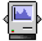
Load Monitor 1.0