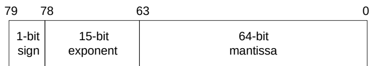
Figure 1 Software SANE Format (80-Bit)