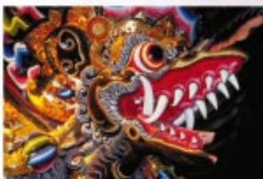
Filter Interpolation: Create dazzling effects automatically by modifying special effects from plug-ins over a series of animation frames or still images.