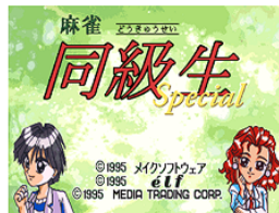
Mahjong Doukyusei Special (dokyusp)