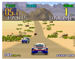
Big Run (bigrun)