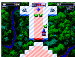
Magical Crystals (mgcrystl)