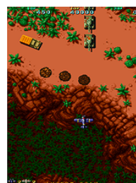
Twin Hawk (twinhawk)