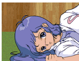
Super Real Mahjong Part 3 (srmp3)