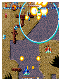
Sand Scorpion (sandscrp)