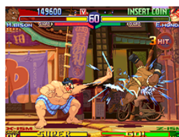
Street Fighter Alpha 3 (sfa3)