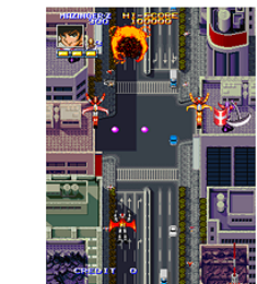
Mazing Z (mazing)