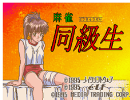
Mahjong Doukyusei (dokyusei)