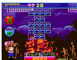
Sotsugyo Shousho (sotsugyo)