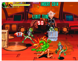
Battle Circuit (batcjt)