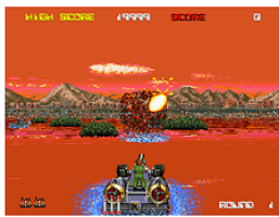
Aqua Jack (aquajack)