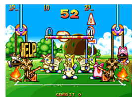
Sokonuke Taisen Game (sokomuke)