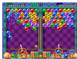
Puzzle Bobble / Bust-A-Move (pbobblen)