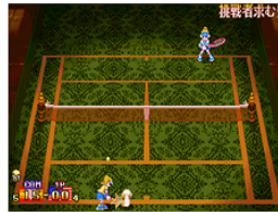
Capcom Sports Club (cscubj)