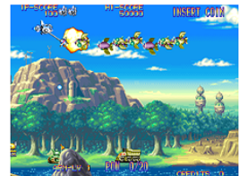
Eco Fighters (ecofght)