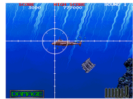
Battle Shark (bshark)