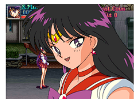
Pretty Soldier Sailor Moon (sailormn)