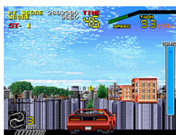
Special Criminal Investigation (sci)