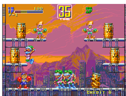
Funky Jet (funkyjet)