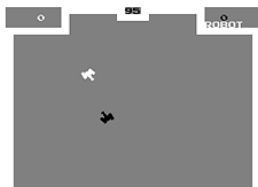
Ultra Tank (ultratk)