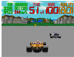
Continental Circus (contcirc)