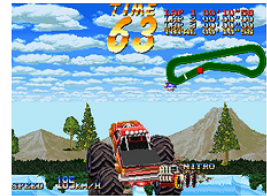
Double Axle (dblaxle)