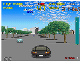
Chase HQ (chasehq)