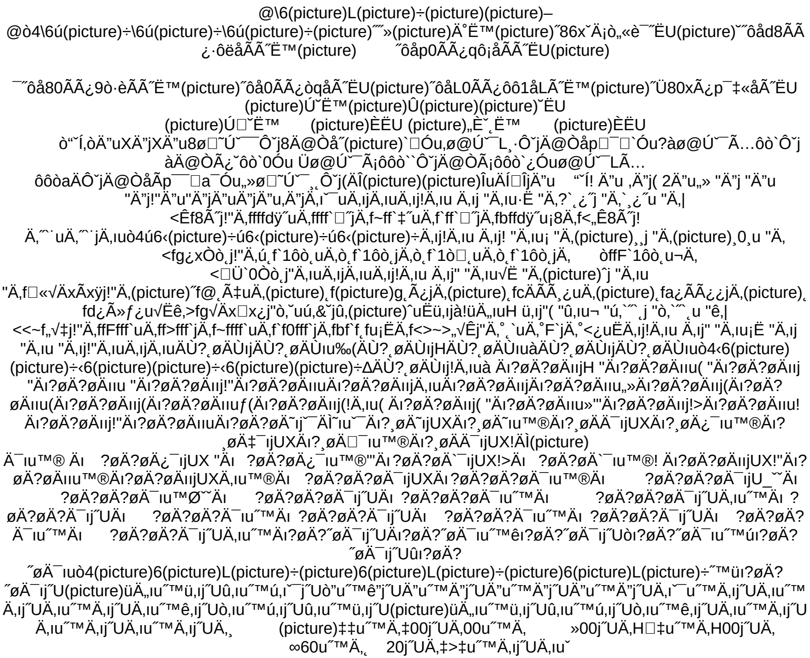
Figure 5. FONT Editor Window

For 'FONT' resources, the editor window is divided into three panes: a sample text pane, a character selection pane, and a character editing pane. These are shown in Figure 5.