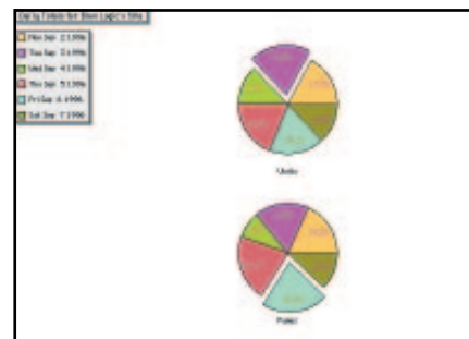
Analyze Web site performance with these powerful graphic reports!