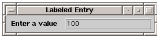
Figure 2: A labeled entry

ue-of notion directly as a slot, rather than a generic function. Virtual slots will be not described here.