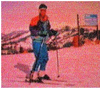
On top of a Ski Mountain in Colorado :-)

I sincerely welcome queries and suggestions. Many of the new features were actually suggestions and requests from users like you. Please indicate the version number of the program you are currently using when you write.