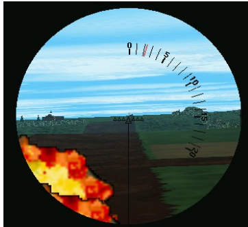
Range Finder view

To determine the range to a target, use the page up and page down keys (possibly labeled PgUp and PgDn on your keyboard) to increase or decrease the range finder setting. Note that these are not the page up and page down keys located on the numeric keypad, but those located to the left of the keypad on extended keyboards. If your joystick is equipped with a "hat" switch, you can also use this to adjust the range finder setting. When you do this, the second cross will move to the left or right. When the darker cross lines up behind its mate, the range finder will have been dialed in for that target. All you have to do now is note the position of the red needle in the distance scale and you will have the range to your target. If you have more than one target in your sight, you can quickly determine the range to each by lining up its two targeting crosses.