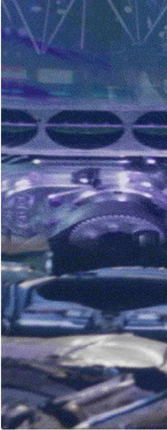
Driving with a Gamepad