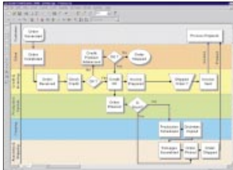
Document, communicate and improve your business processes with iGrafx FlowCharter, the easiest process management improvement tool on the market.

iGrafx FlowCharter focuses on helping you with the documentation, communication and improvement of business processes. Using intuitive features such as intelligent swimlanes, automatic off-page connectors, and links to subprocesses or Web pages, you can quickly document and communicate the way your business runs. Critical details such as cycle time, cost and resource information are easily collected and stored in your diagrams allowing for thorough analysis of your processes. Plus, thousands of hours of usability science make iGrafx FlowCharter the easiest process improvement tool on the market. Start improving your business today with iGrafx FlowCharter.