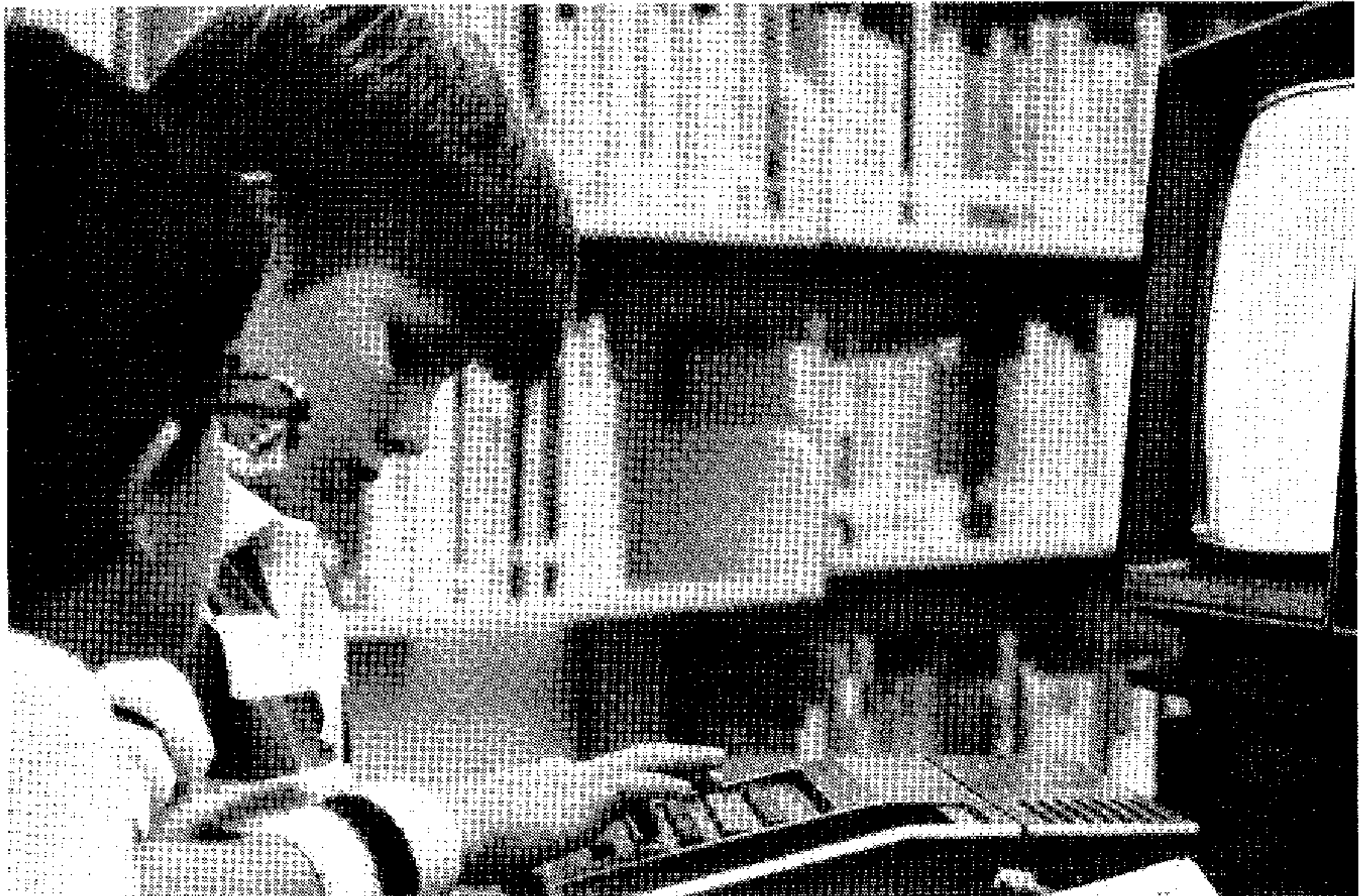
Shown here are two of the eighty Dallas, Texas area children who participated in a recent 10-hour seminar learning to use TI LOGO with the TI Home Computer.

Suggested retail price for TI LOGO (model number PHM 3040) is $299.95. See your local dealer for availability in your area.