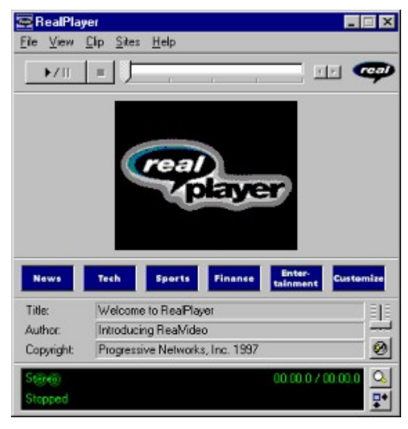
Overview of RealPlayer

The RealPlayer enables you to listen to RealAudio files and view RealVideo files over the Internet or over a local area network in real time, without downloading the clip to your hard drive. When you click a RealAudio or RealVideo link from a World Wide Web page, your RealPlayer automatically opens and plays the file you have selected.