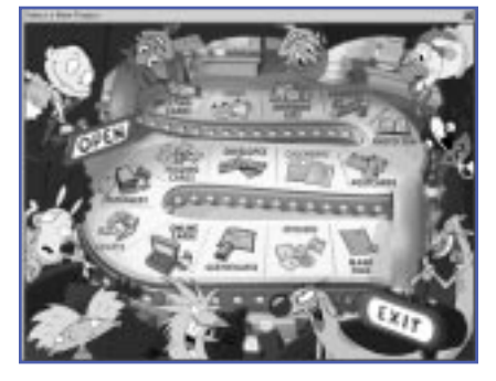
Photo Fun: These projects include photo frames and photo album pages designed for you to use with your own photos.

Banners: A variety of banners for all occasions and growth charts to measure your height!