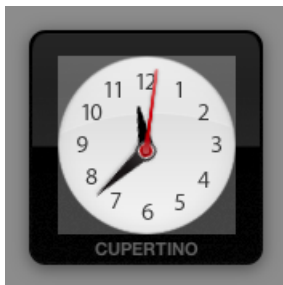
Figure 1 The World Clock canvas region

Now that the canvas region has been defined, it is ready to be filled.