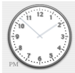
Custom Control using Graphite Tint