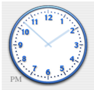
Custom Control using Blue Tint