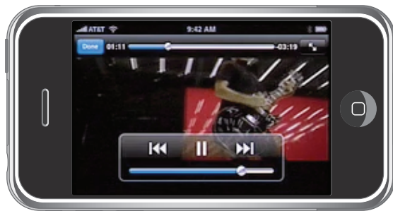
Figure 2-1 Media player interface with transport controls

To initiate video playback, you must know the URL of the file you want to play. For files your application provides, this would typically be a pointer to a file in your application's bundle; however, it can also be a pointer to a file on a remote server. Use this URL to instantiate a new instance of the MPMoviePlayerController class. This class presides over the playback of your video file and manages user interactions, such as user taps in the transport controls (if shown). To start playback, simply call the play method of the movie controller.