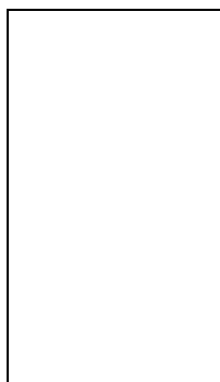
Figure 5/Q.704 - CCITT 35770

Principles relating to the number of load—shared links appear in Recommendation Q.705.