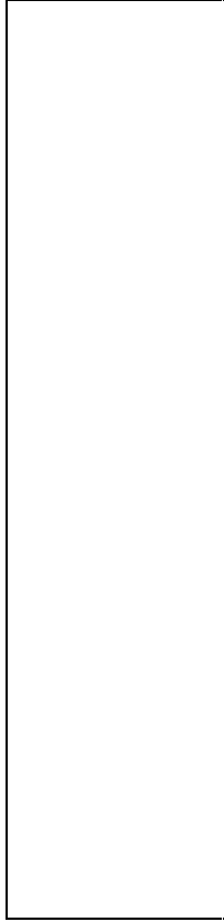
Figure 6/Q.704 (feuille 3 sur 4) - CCITT 60721