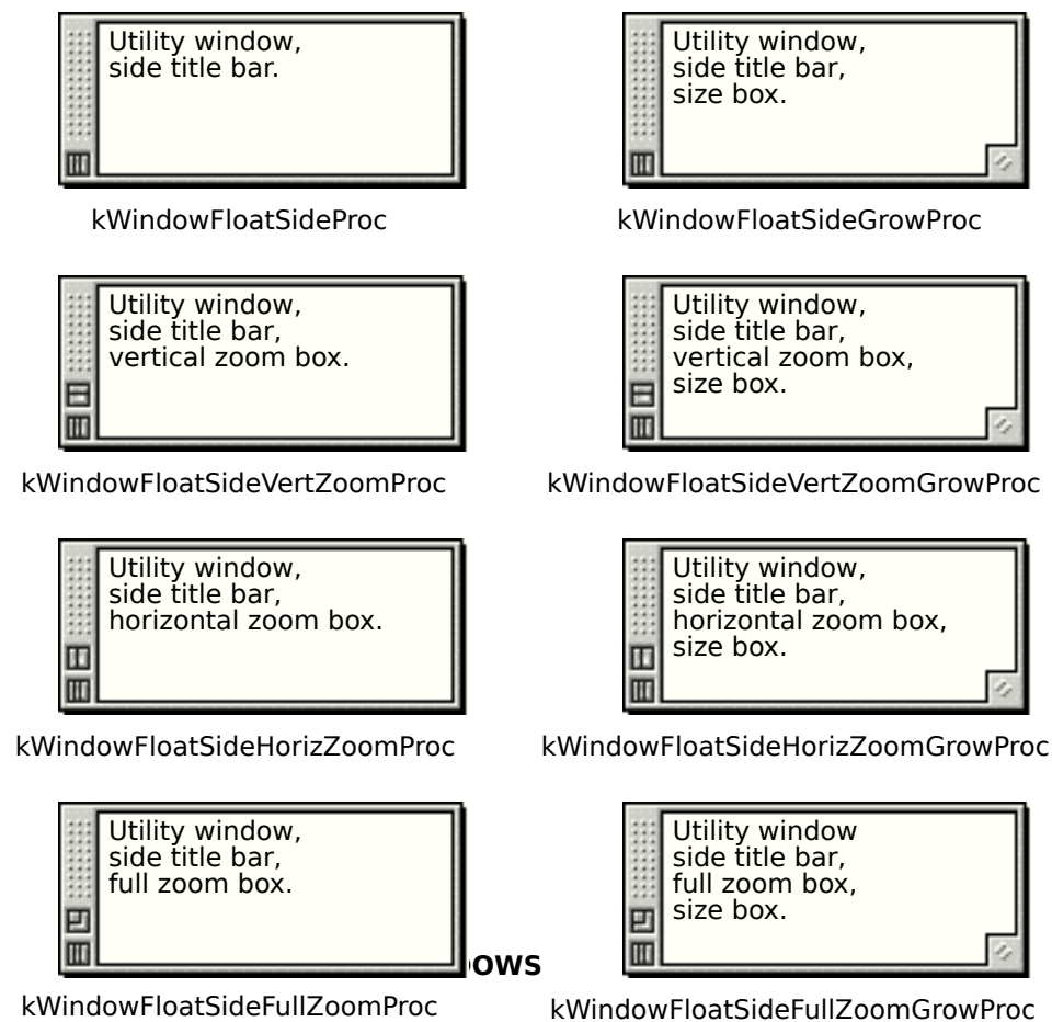
FIG 3 - WINDOW TYPES FOR FLOATING WINDOWS (TITLE BAR AT LEFT)