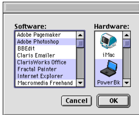
FIG 1 - DIALOG BOX WITH TWO LISTS

To create a list with graphical elements, such as the list at the right at Fig 1, you must write a custom list definition function (see below), because the default list definition function only supports the display of text.