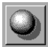
Icon used for the a generic object

This is done by pointing to the button and Control-Dragging a line from the button to the icon in the lower left corner of the screen labeled MyHelloClass Instance.