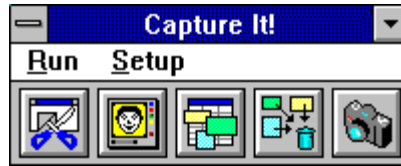
Main Window of Capture It!