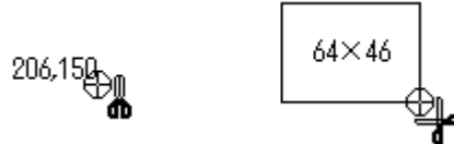
Indicating Box Size and Cursor Location

By setting the Show Size item in Capturing Setup, when using the Box Capturing Mode , the cursor coordinates and box size will appear on the screen at the beginning and end of the capturing, respectively: