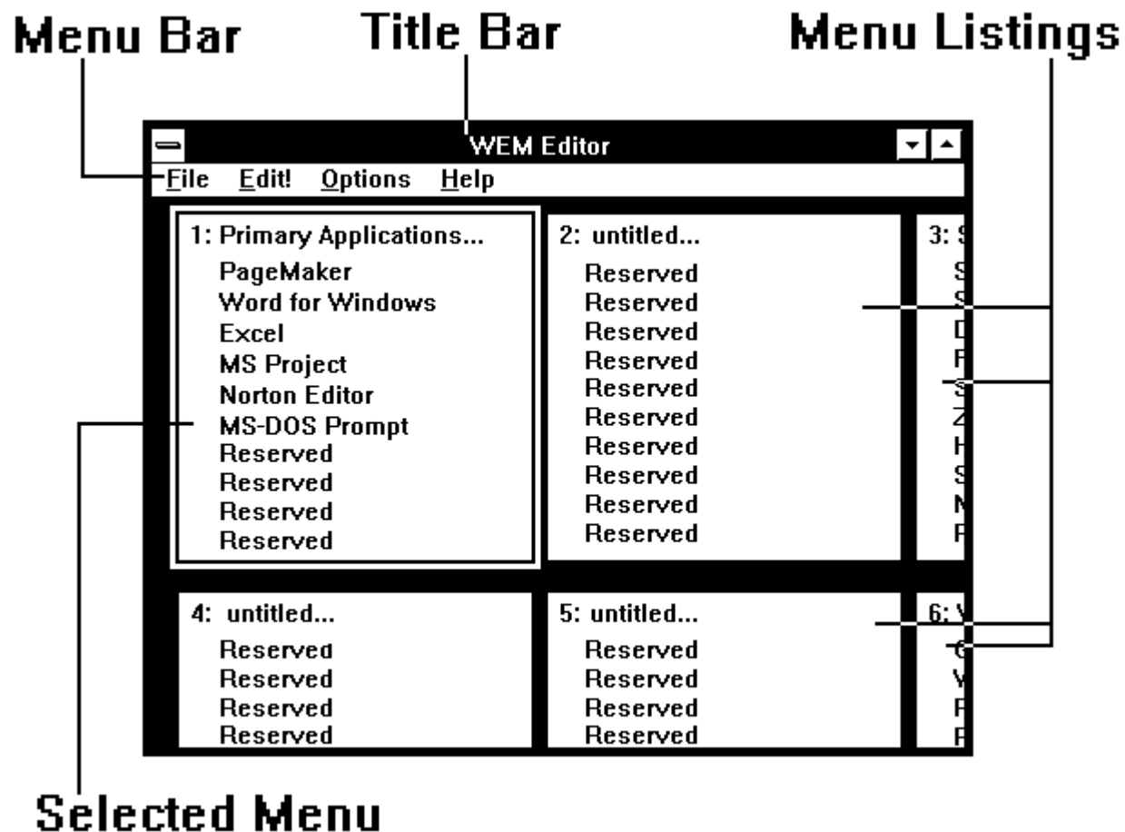
Figure 2 The WEM Editor Window

The Title Bar. As with all Windows applications, the title bar shows the name of the application.